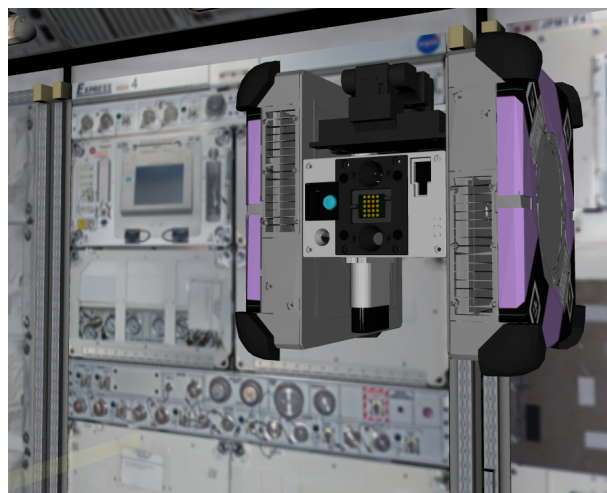
Fig. 1. Astrobee robot in the simulator.

This distributed multi-robot system comprised of both embodied actors (e.g., robots) and minimally embodied actors (e.g., the Gateway) must be capable of (1) autonomously allocating tasks to and coordinating computation between multiple robot bodies, and (2) accepting directives and communicating feedback to human teammates, both through standard control interfaces and through natural language. Interaction of the distributed multi-robot system with human teammates can occur in a variety of ways: each individual robot and the Gateway may have individual minds and one-to-one communication with human teammates, robots and the Gateway may all share the same mind (i.e. a hive mind) and line of communication, or