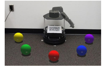
(d) Physical Robot with a virtual (AR) arm pointing to an virtual (AR) referent (V→V)