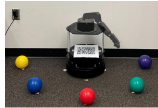
(c) Physical Robot with a virtual (AR) arm pointing to a physical referent (V→P)