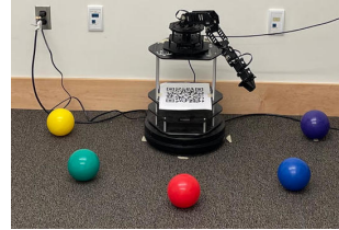
(a) Physical Robot with a physical arm pointing to a physical referent (P→P)