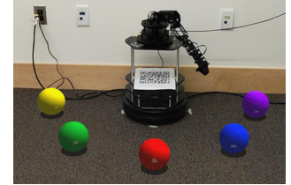
(b) Physical Robot with a physical arm pointing to an virtual (AR) referent (P→V)