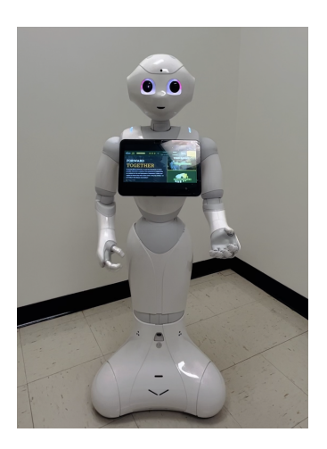
Fig. 2. An image of the Pepper robot used in the current experiment. On the robot's tablet, the website showing the information about the fundraising event was presented.

confirmed that the robot was facing the participants, they left the room and started a program prepared on Choregraphe. The robot started to describe the charity event organized to raise funds to help students who are attending the university and experiencing challenges, including economic and financial concerns and physical and mental health issues. This charity event was chosen from a list of fundraising events taking place at the university, and screenshot images of the university website introducing the event was presented on the robot's tablet, as the robot talked about the event (See Figure 2).