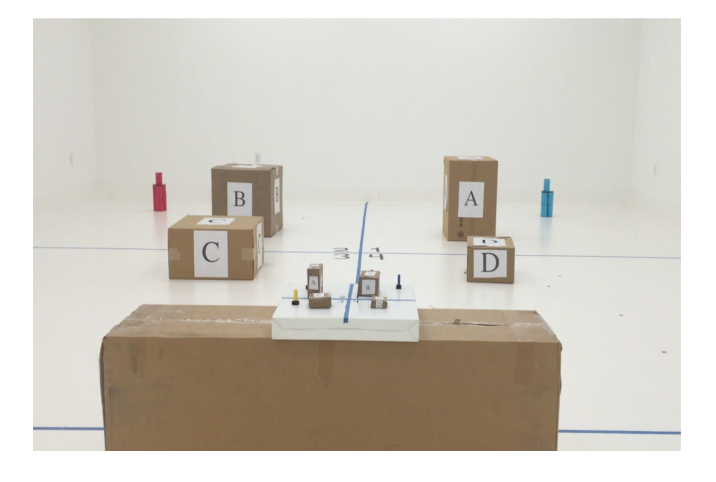
Figure 1: Situated Interaction Context (Bennett et al., 2017)